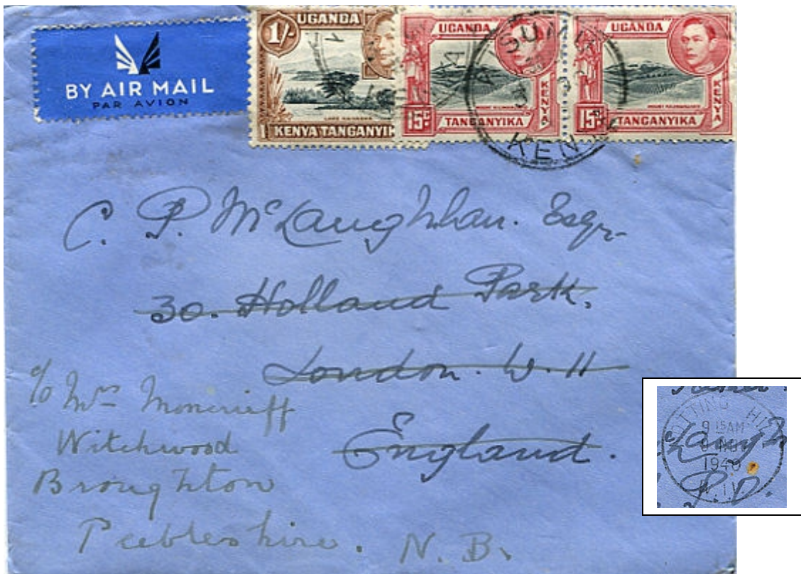
Figure 7.7: Flown from Kisumu on 7 th October on WS 20 and redirected in London on 9 th November.