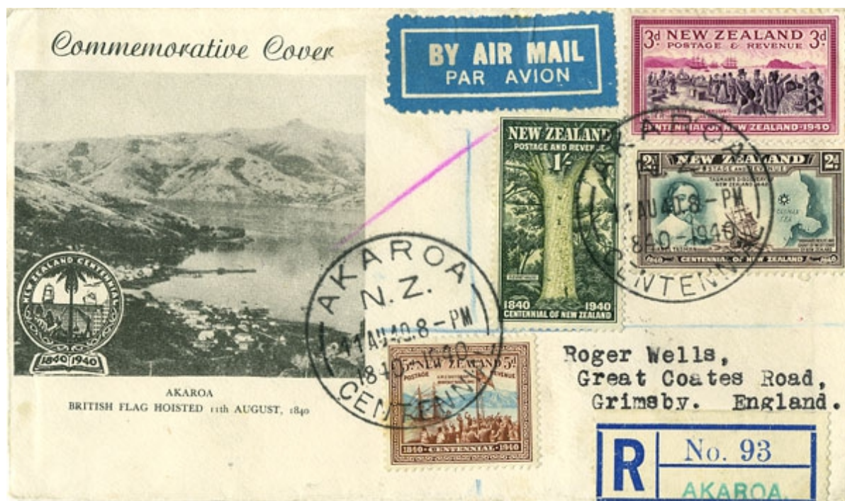
Figure 7.1: Registered cover postmarked on 11 th August in New Zealand and would have been flown trans-Tasman on 15 th August. No censor or transit marks. Flown from Sydney on XWS 9 .