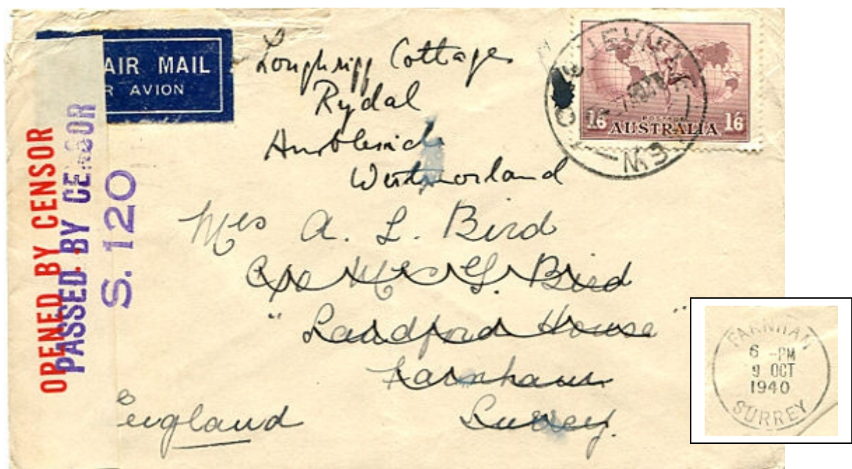
Figure 7.3: Australia – UK, 27 th August – 9 th October, likely flown on WS 13 .

By sea to UK 21 Sep – 7 Oct Richmond Castle