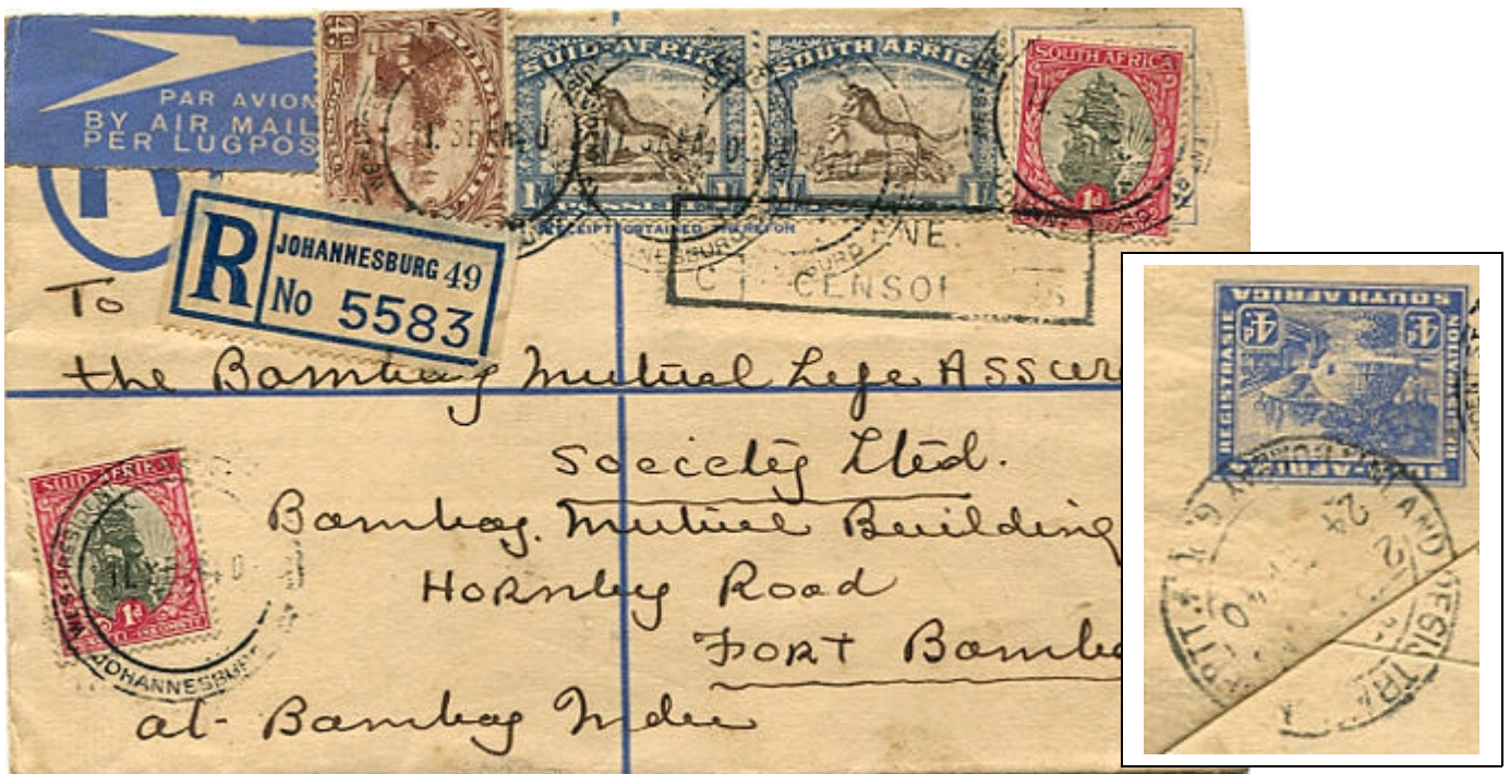
Figure 7.5: Johannesburg – Bombay, 11 th – 24 th September, likely flown on NE 17

Two covers are shown that were sent on WS 20 . It left Sydney on Wednesday 25 th September and arrived in Durban on 8 th October. The cover in Figure 7.6 is postmarked on 23 rd September 1940 in Australia and was opened by the censor in Sydney. It is addressed to London and was redirected in Leatherhead on 12 th November. The cover in Figure 7.7 is postmarked in Kisumu on 3 rd October 1940 and was redirected in London on 9 th November. WS 19 was overnight in Kisumu on 2 nd – 3 rd October, but this cover would have missed that flight and have been sent on WS 20 that was overnight on 6 th – 7 th October.