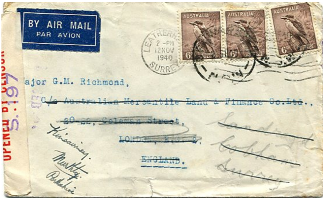
Figure 7.6 Postmarked Australia 23 rd September, redirected UK 12 th November. Flown on WS 20 .