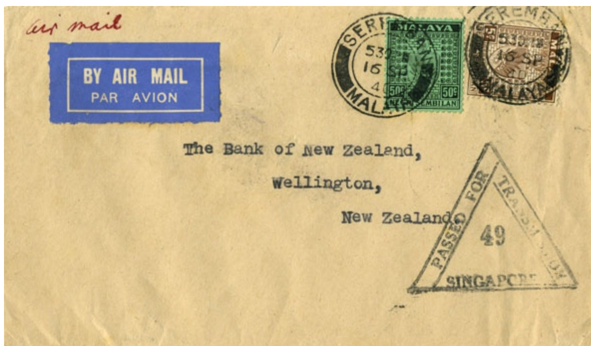
Figure 7.4: Postmarked on 16 th September in Seremhan in Negri Sembalin, Malaya and passed by the censor in Singapore. Flown from Singapore on either NE 15 or NE 16 . Franked with 55c.

A cover postmarked in Slough, England on 19 th August was backstamped in Sydney on 26 th September [Wat1]. The date fit with it having been in the mail that left London on 21 st August, was carried to South Africa on the Arundel Castle and flown on NE 16 and arrived in Sydney on 24 th September. The London – Sydney transit time was 34 days.